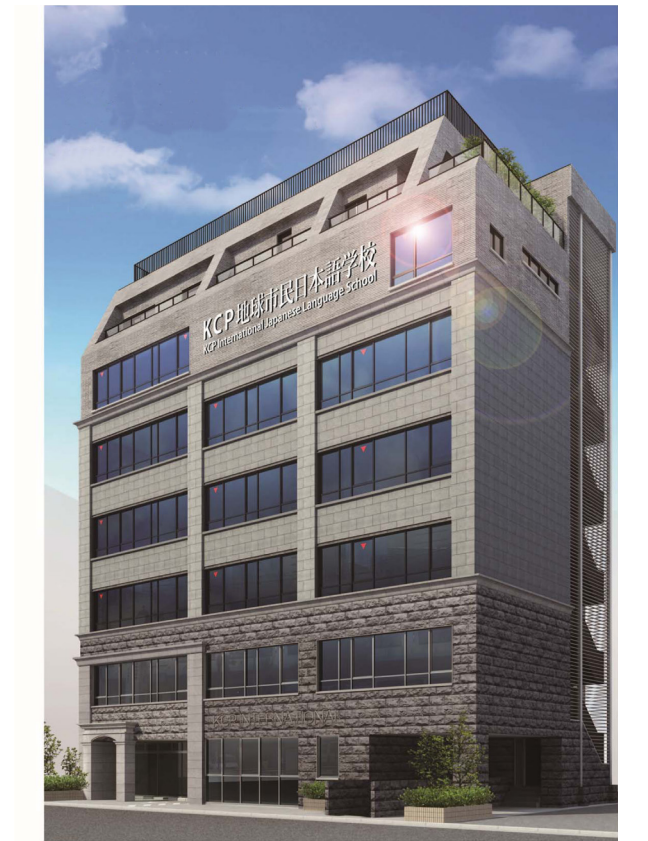
KCP Campus in the heart of Tokyo